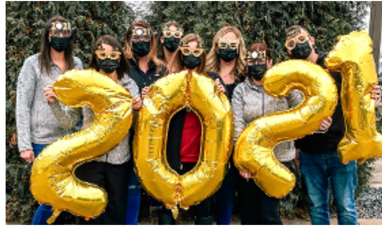
North and East Metro Management team holiday card.