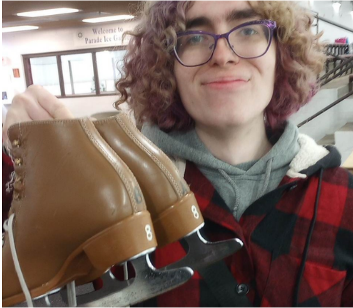
Dawn went ice skating at an indoor ice skating rink in Minneapolis recently!